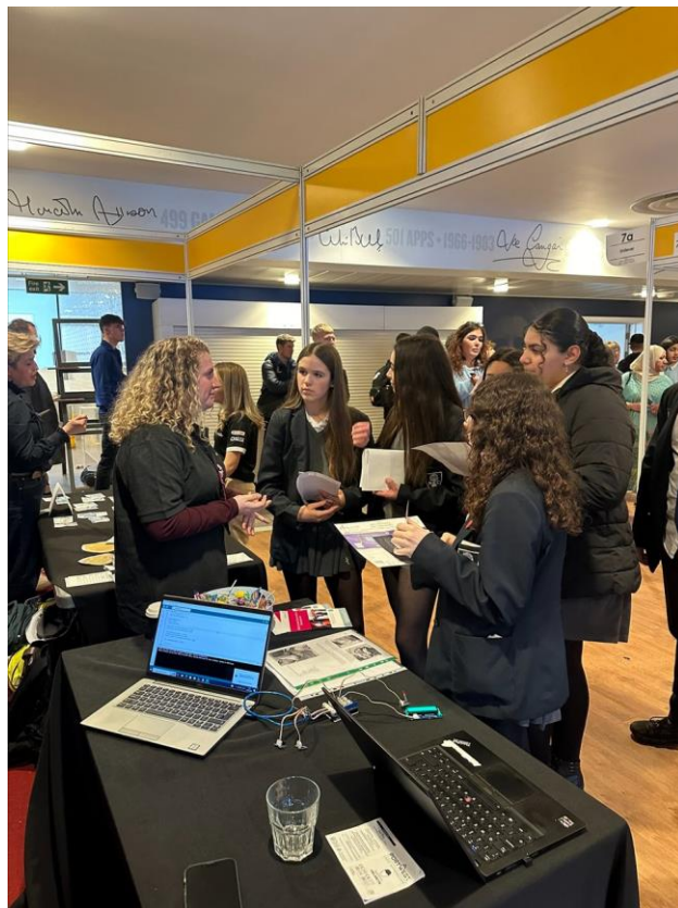
7 - Apprenticeship Show