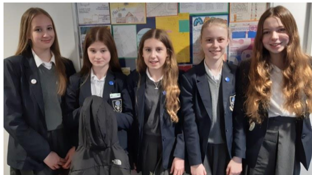
6 - Pi Day