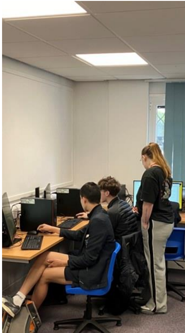
8 - ASK Session

We are planning on working with the ASK team over the coming years to support each year group and ensure that students are aware of the apprenticeship pathway and to also give the best support possible to students who would like to go down that pathway.