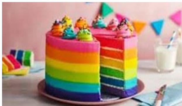
14 - Bake Off