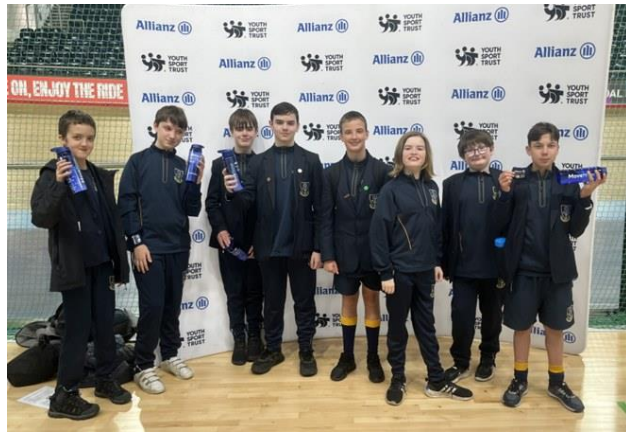
8 - Allianz