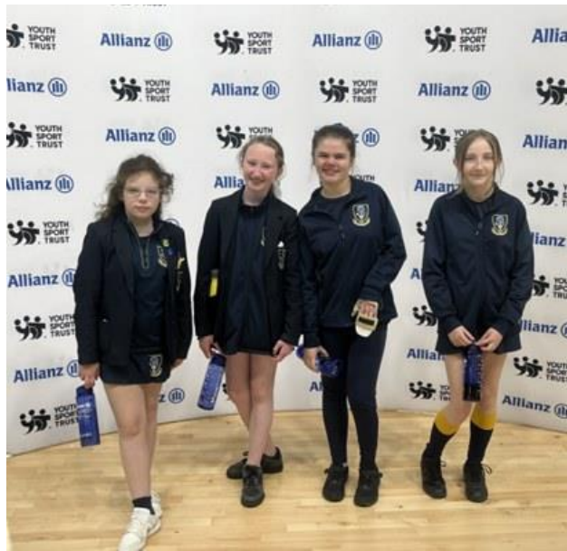
9 - Allianz