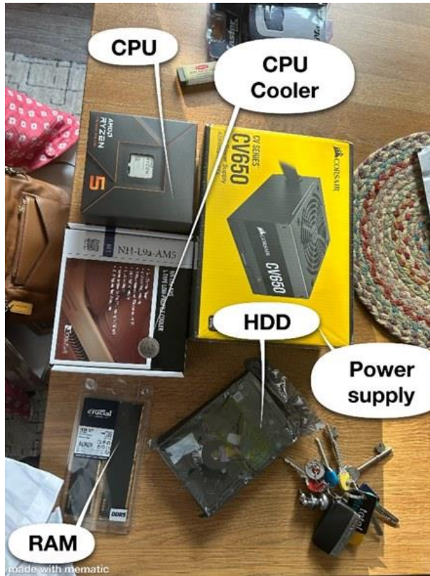
2 - Hardware