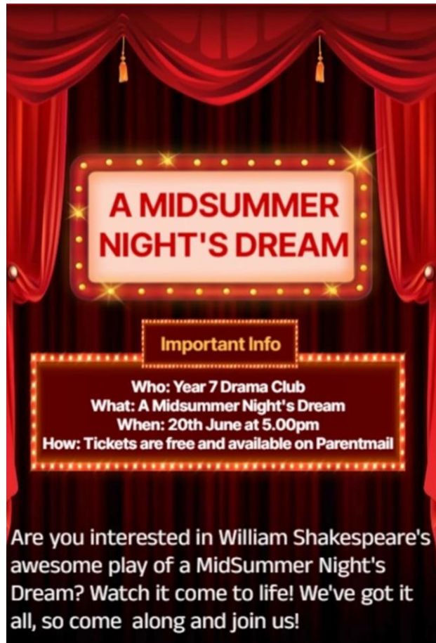
15 - Midsummer's Night Dream