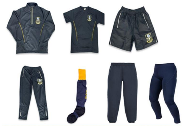
11 - NCS PE Kit