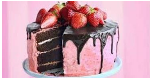
13 - Bake Off