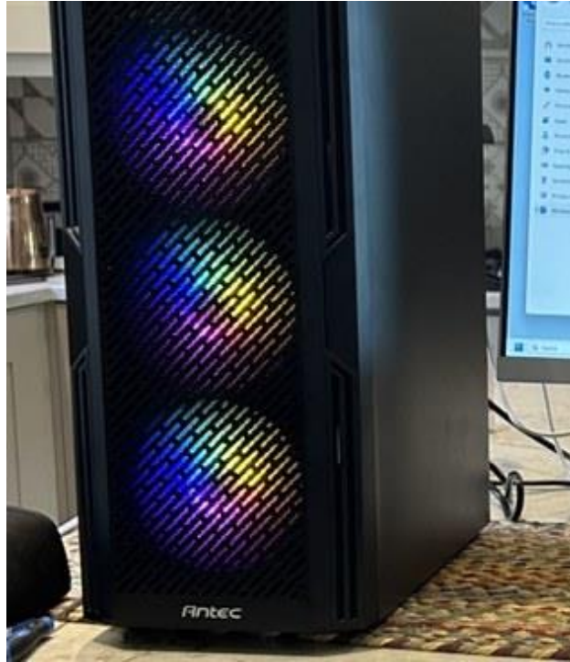
4 - Drives