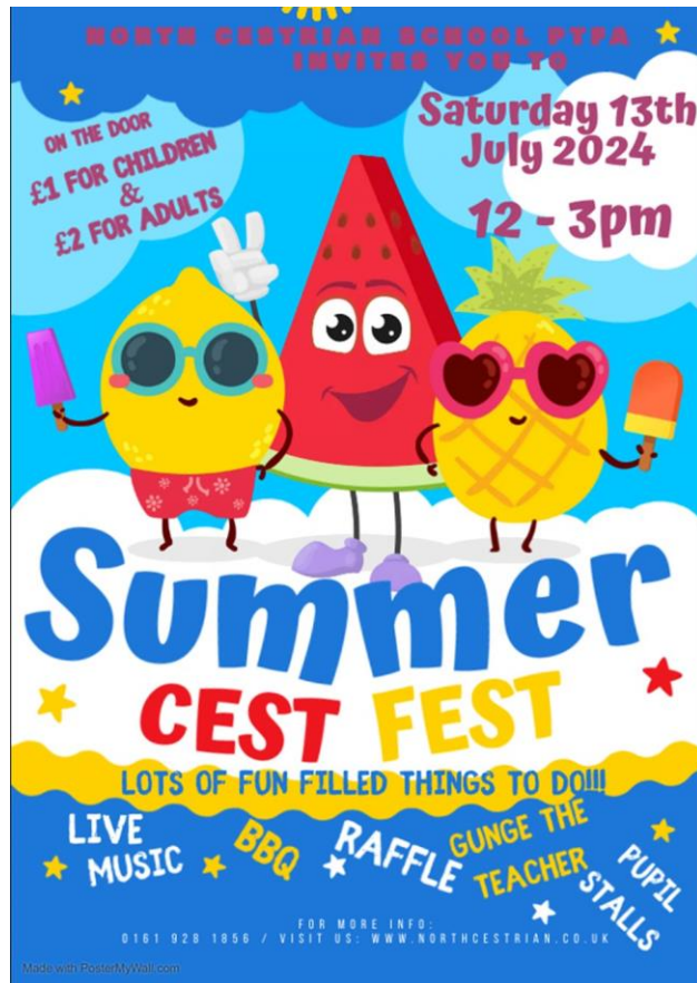
1 - Cest Fest 2024