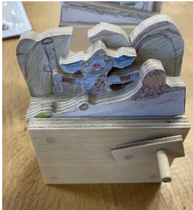
14 - Y8