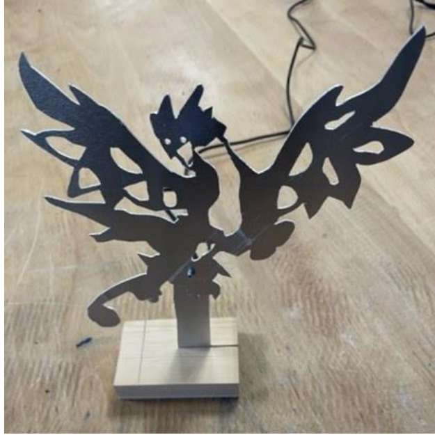
9 - Y9