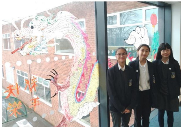
19 - Chinese New Year