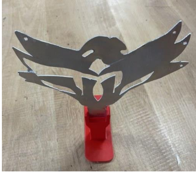
11 - Y9