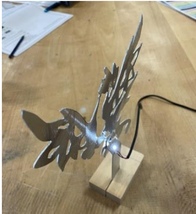
10 - Y9