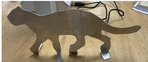
7 - Y9