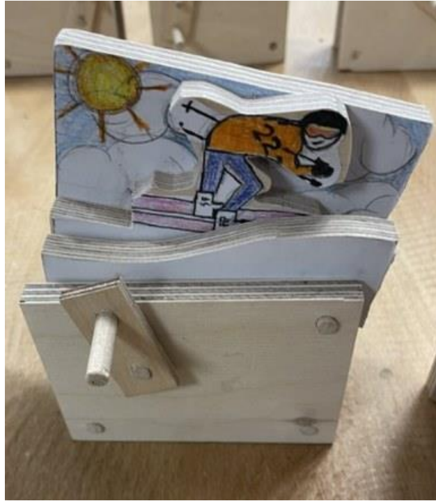
13 - Y8