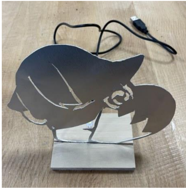
12 - Y9