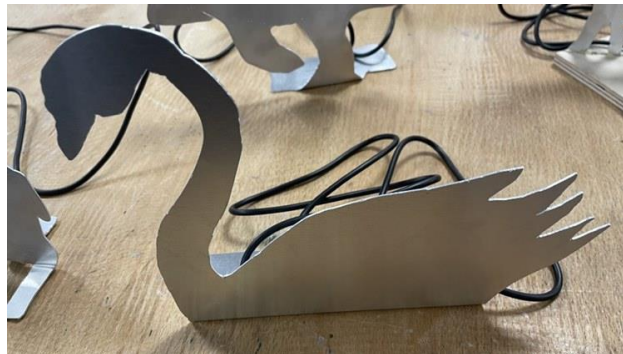
8 - Y9