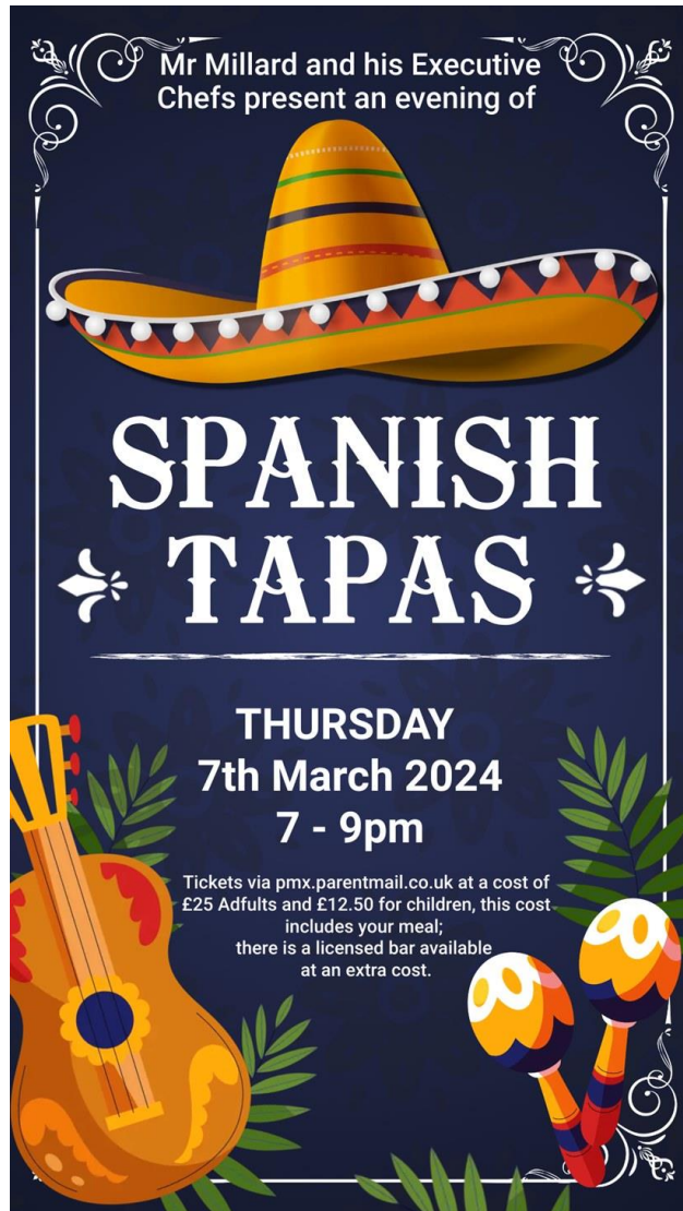
18 - Tapas Evening